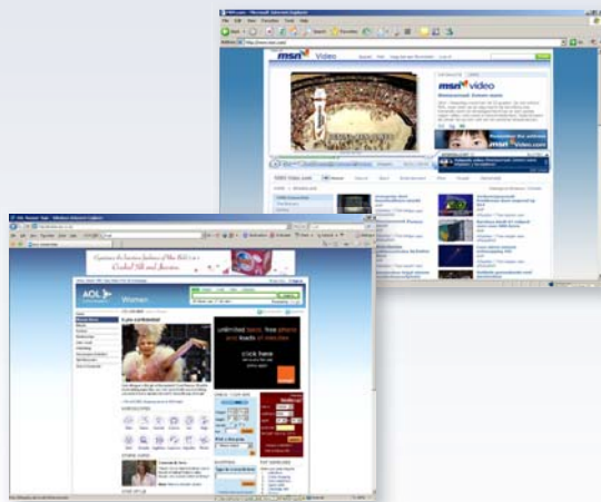
Measuring the brand impact of online campaigns

It is a live, in-market test that measures the total branding impact of an online advertising campaign. It can